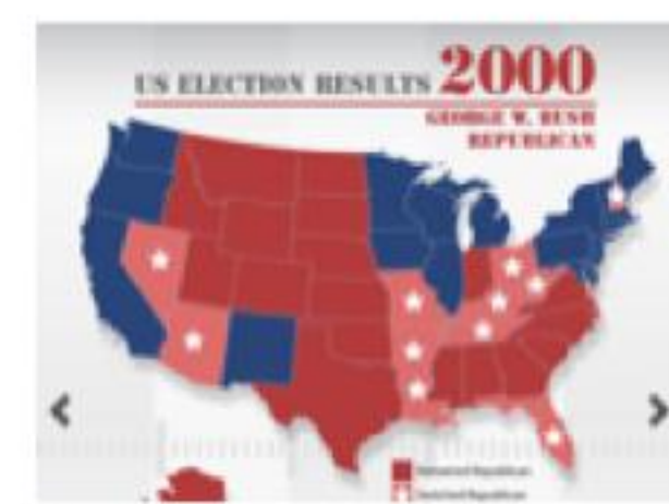
26/10/2012 2012 presidential election two decades of swing states