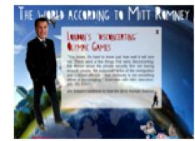
02/08/2012 The world according to Mitt Romney