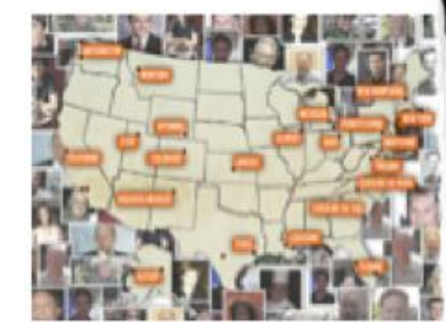
05/10/2012 2012 presidential election Voters' voices