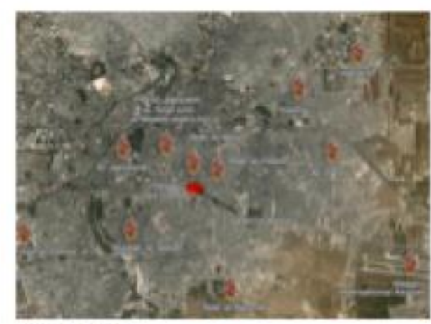
13/08/2012 Aleppo: Main areas of confrontation