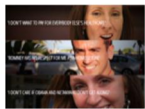
04/11/2012 2012 presidential election Swing states: voter profiles

View All Animated Graphics Interactive maps Timelines