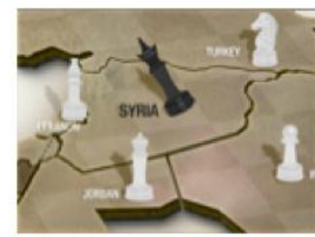
09/08/2012 The Middle East chess board: what would happen if Assad left the game?